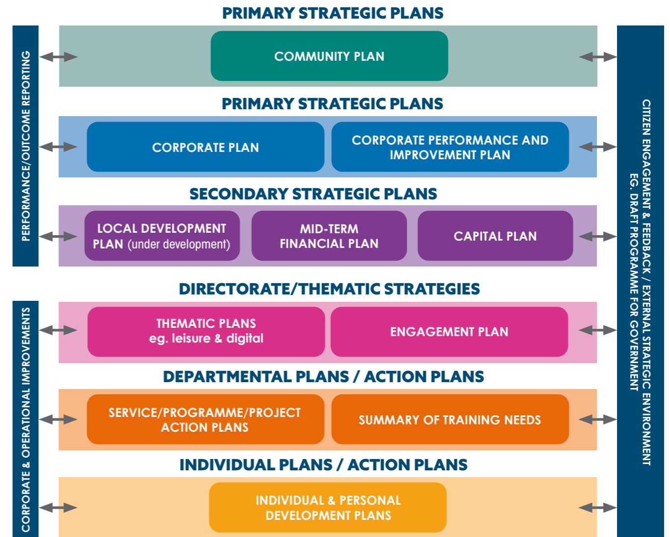
Figure One, illustrates our strategic performance framework demonstrating how the Council's strategic objectives are cascaded throughout the organisation.

PLEASE NOTE this Framework will be reviewed and may be changed as required